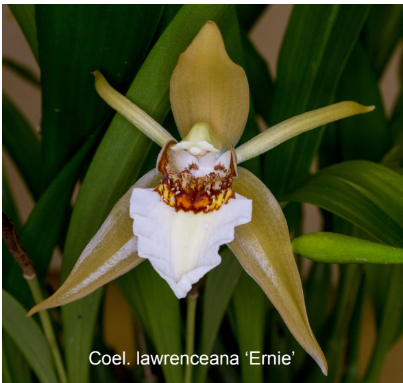
Coel. lawrenceana 'Ernie'