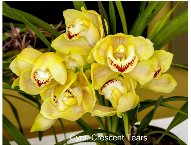
Cym. Crescent Tears