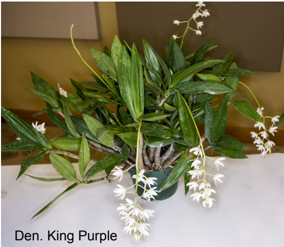
Den. King Purple