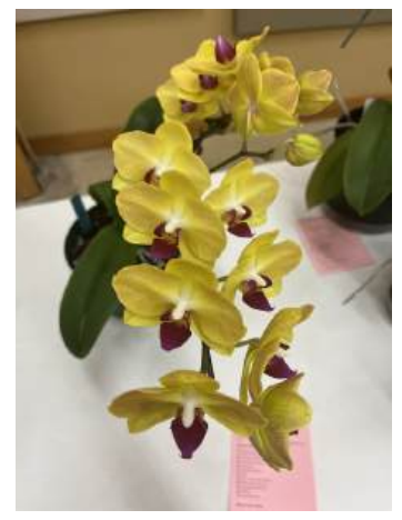
Phal Taida Sunflower Box Taida Apollo