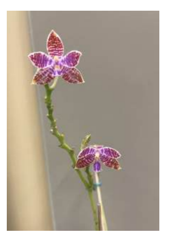
Spec Phal leuddemanniana