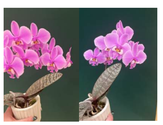
Spec Phal schilleriana