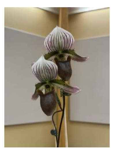
Paph Virginia Creeper