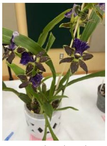
Zygopetalum Blue Velvet