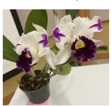
Cat Compton Grand