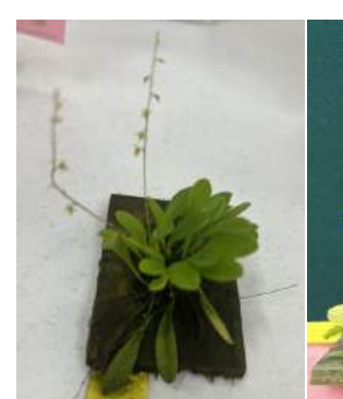
Mini Platystele viridis