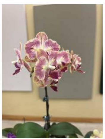
Phal Fullers Gold Stripes