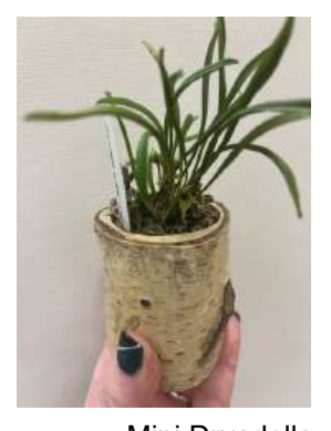
Mini Dryadella guatemalensis