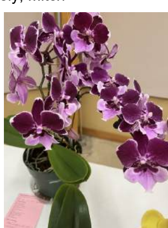
Phal Lioqulin Hot Lip "A19459"