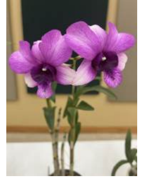
Den Bangkok Fancy