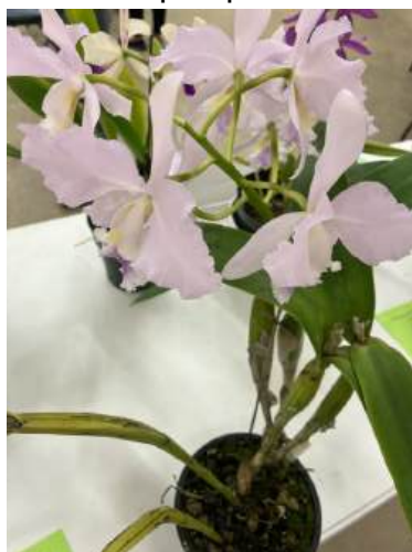
Cattleya Big Ben