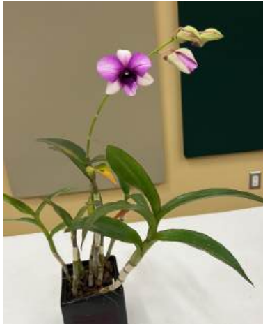
Dendrobium Bangkok Fancy