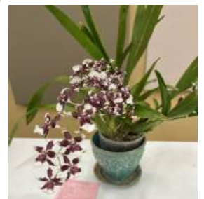
Onc. Heaven Scent