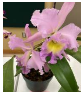
Rhy. Nacouchee Mission Valley