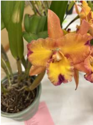
Rhynccattleanthe Momilani Rainbow