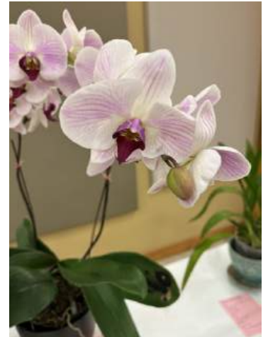
Phal. unidentified (Candy-striped)