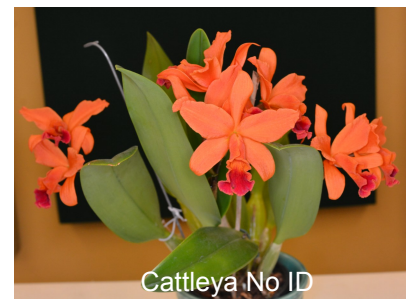
Cattleya No ID