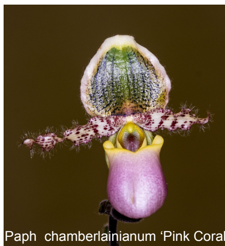
Paph chamberlainianum 'Pink Coral'