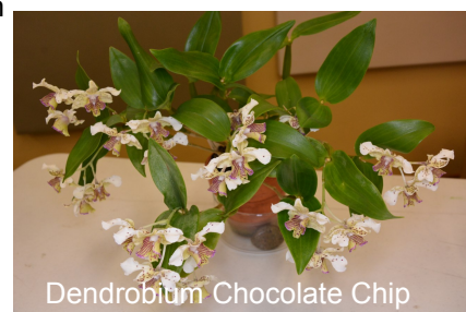
Dendrobium Chocolate Chip