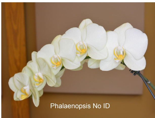
Phalaenopsis No ID