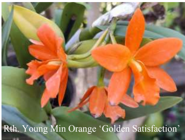
Rth. Young Min Orange 'Golden Satisfaction'