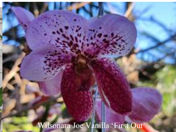
Wilsonara Joe Vanilla 'First Out'