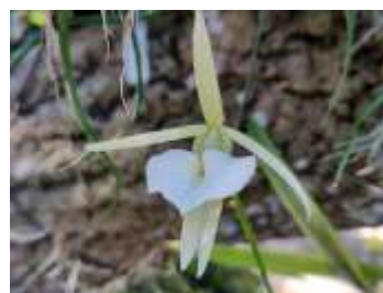
Brassavola nodosa x nodosa 'Mas Major' AM/AOS