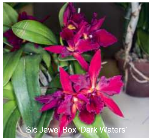
Slc Jewel Box 'Dark Waters'