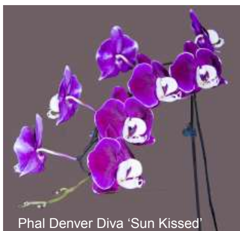
Phal Denver Diva 'Sun Kissed'