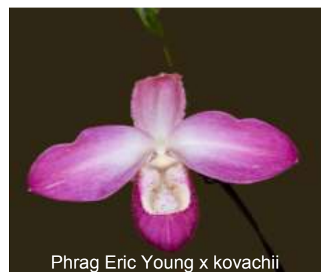
Phrag Eric Young x kovachii