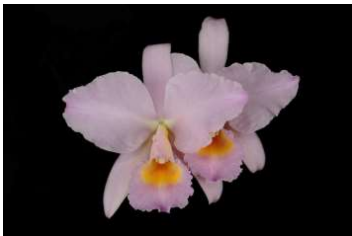
Rth. Meghan Markle 'Archie' HCC/AOS