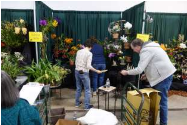
Setting up the BCOS Exhibit at the March 2023 SEPOS show.

PROGRAM: A Retrospective of the 2023 SEPOS Orchid Show – Stuart Hughes