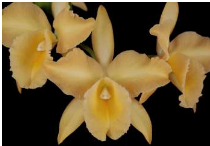
Rth. Meghan Markle 'Lilibet' AM/AOS