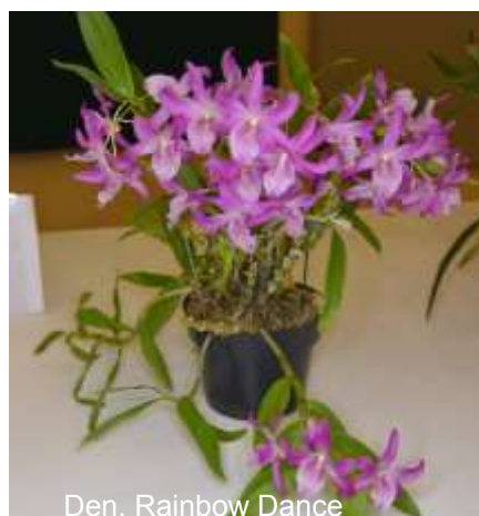
Den. Rainbow Dance