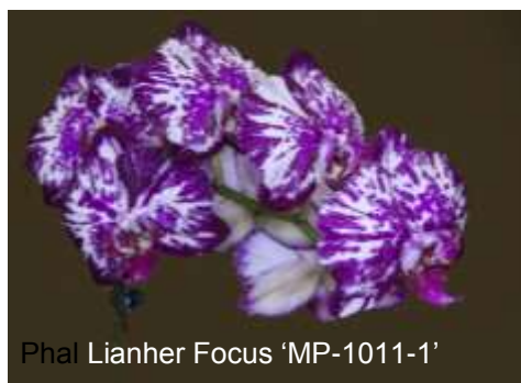
Phal Lianher Focus 'MP-1011-1'