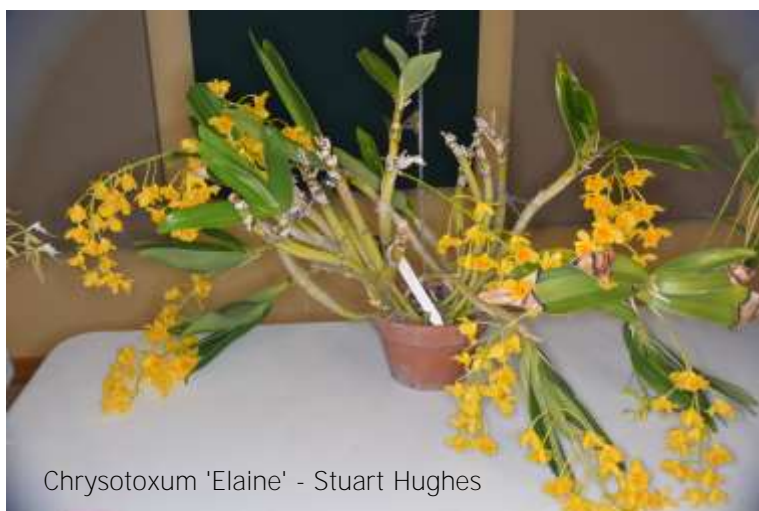
Chrysotoxum 'Elaine' - Stuart Hughes