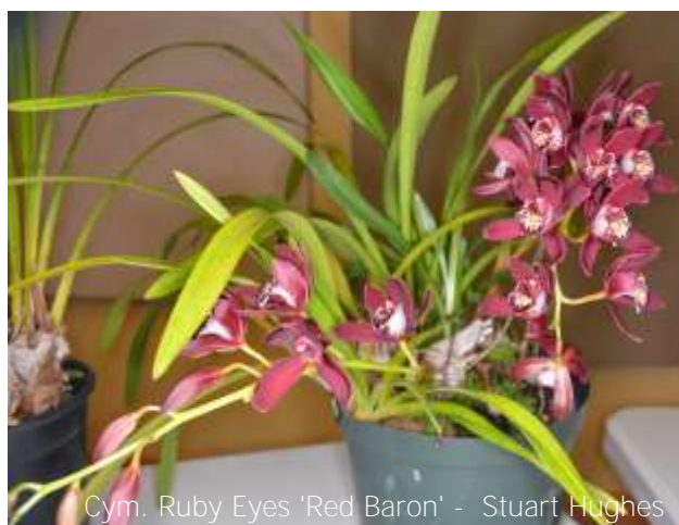
Cym. Ruby Eyes 'Red Baron'