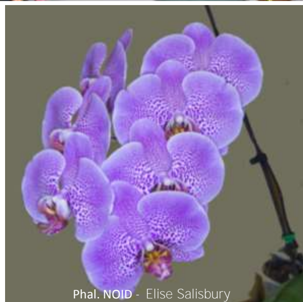
Phal. NOID - Elise Salisbury