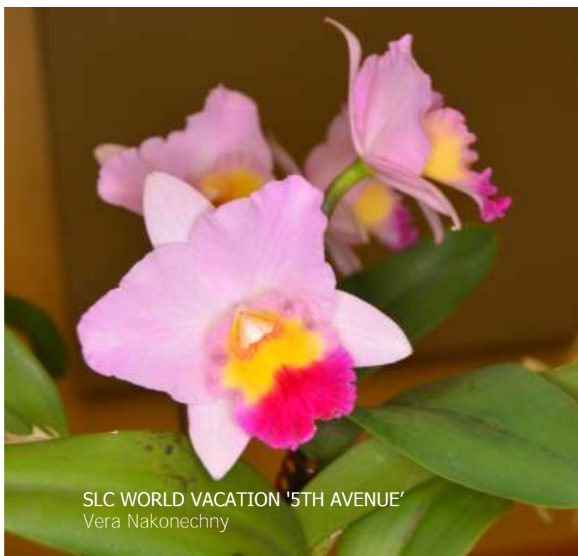
SLC WORLD VACATION '5TH AVENUE' Vera Nakonechny