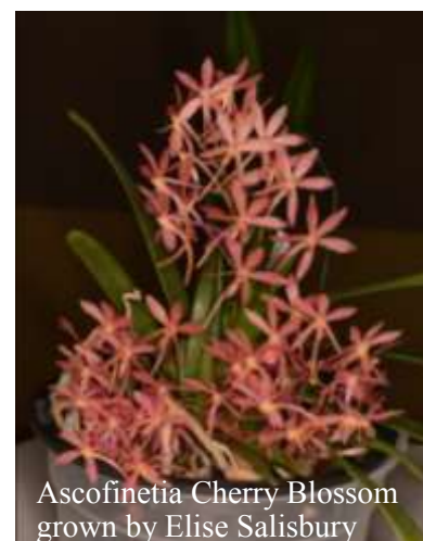
Ascofinetia Cherry Blossom grown by Elise Salisbury