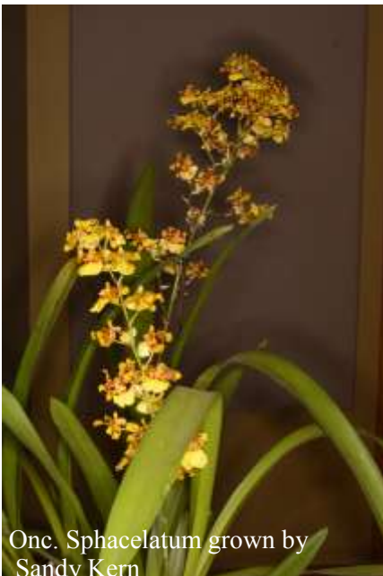
Onc. Sphacelatum grown by Sandy Kern