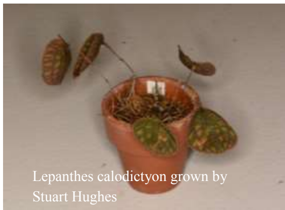
Lepanthes calodictyon grown by Stuart Hughes