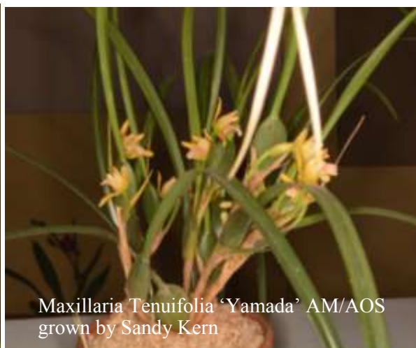
Maxillaria Tenuifolia 'Yamada' AM/AOS grown by Sandy Kern